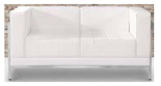
Leather Loveseat (available in black or white)