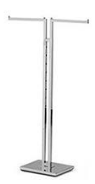
Adjustable T-Rack/ Bag Holder