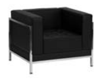
Leather Chair (available in black or white)