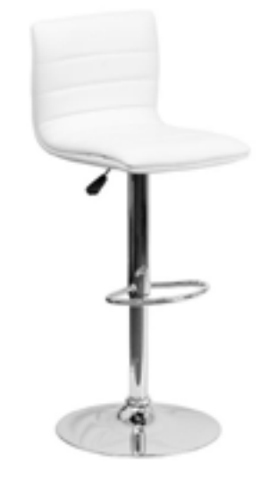
Premium White Leather Counter High Stool