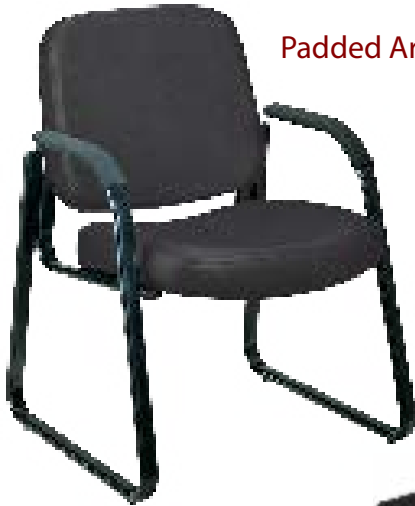
Padded Arm Chair