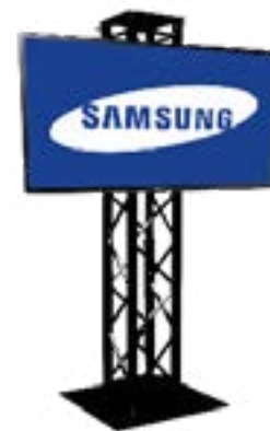
Display Stand (Truss)