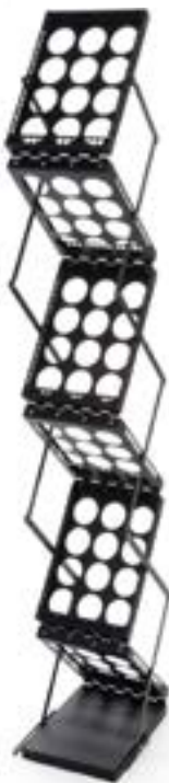
Literature Rack (black and silver available)