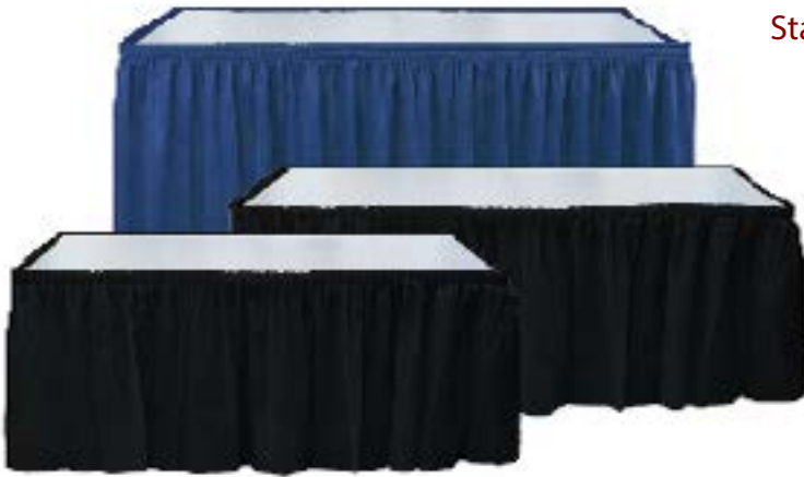
Standard & Counter High Skirted Tables (4 ft., 6 ft. and 8 ft. lengths available)