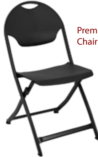
Premium Folding Chair - Black