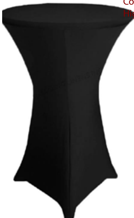
Counter High Stool