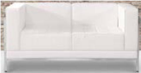
Leather Loveseat (available in black or white)