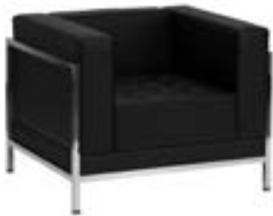
Leather Chair (available in black or white)