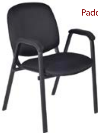
Padded Arm Chair