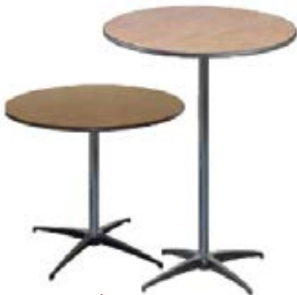
30" Lowboy & Highboy Tables