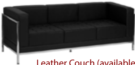
Leather Couch (available in black or white)