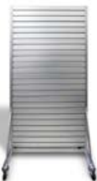
3'x6' Slat Wall