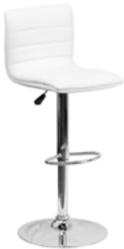
Premium White Leather Counter High Stool