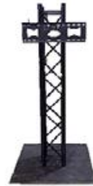
Display Stand (Truss)