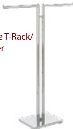
Adjustable T-Rack/ Bag Holder