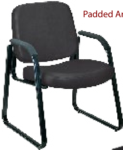
Padded Arm Chair