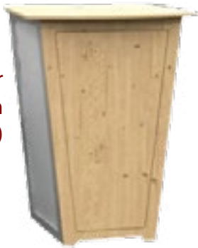
Tapered Counter (plain or w/custom graphic)