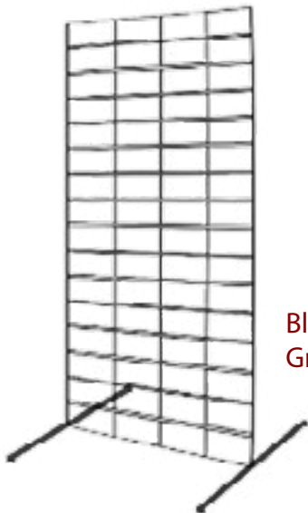
Black 6'x2' Gridwall