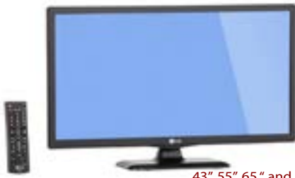
43", 55", 65" and 75" Flat Panel Displays w/Power Cord and Remote