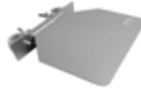
Laptop DVD Player Shelf for Display Stand